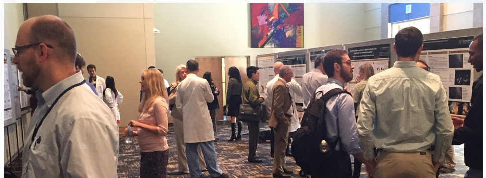
Poster viewing session